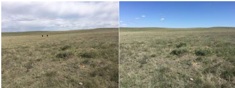
The SW corner of the Ridgeline pasture yesterday (right) and last Wednesday (left).